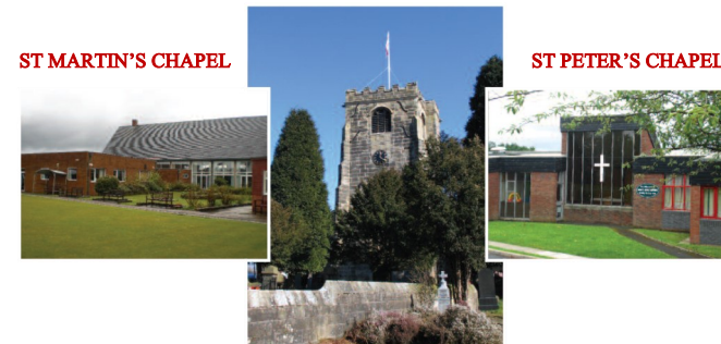
ST MARTIN'S CHAPEL

We seek to make Jesus known in our community, through our joyful, loving service & worship